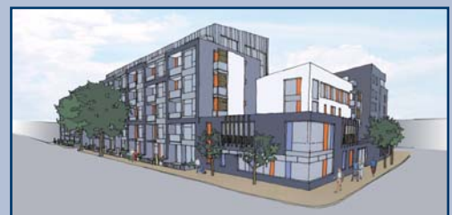
Network Housing Group - Kenworthy Road.

Having the ability to proactively work within economic constraints means that 2009 is set to be very exciting with several mixed-use, affordable housing developments due to commence across London and the South.