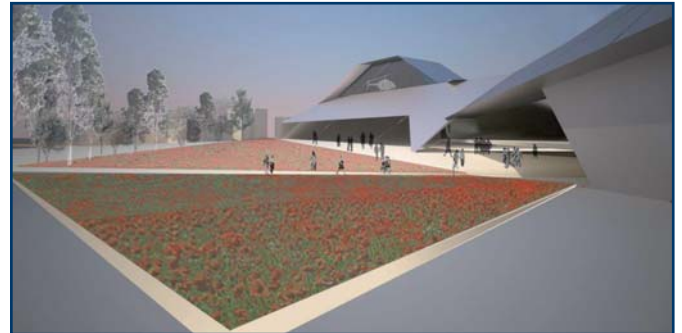
View across museum entrance.

P H Warr plc, the property and construction surveying specialist, has won a contract to manage the costs associated with building the Museum of Conflict in Tripoli, which will tell the story of Libya's military history.