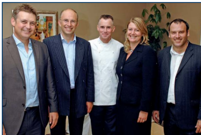
P H Warr plc celebrates with top celebrity chef Gary Rhodes.

Refurbishment work has been carried out sympathetically to ensure its wonderful character and dignity is retained. For more information visit www.thekings-christchurch.co.uk