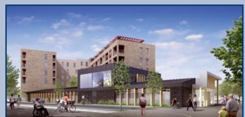
L&Q Group - Aylesbury Regeneration, Phase 1a.