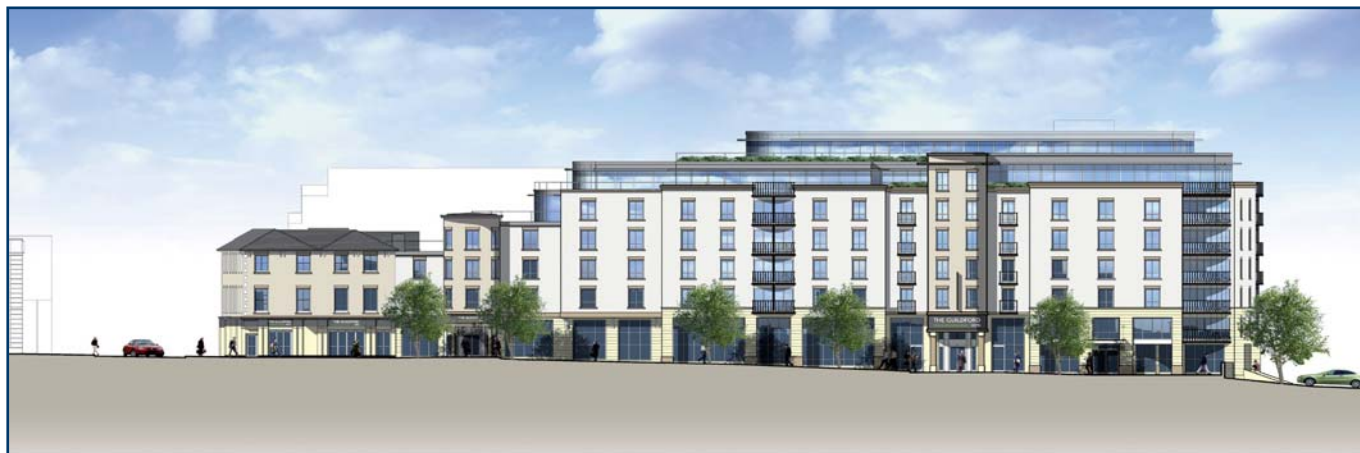
The Guildford Hotel.

P H Warr plc continues to build upon its hotel and leisure industry expertise having recently been appointed by Bank of Scotland to provide monitoring surveying services on the prestigious £35 million redevelopment of the existing Guildford Hotel in the centre of Guildford, Surrey.