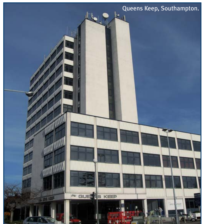
Queens Keep, Southampton.

We look forward to welcoming new and existing clients to our offices in 2009.